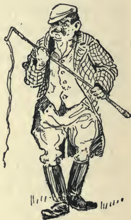
HE WOULD HAVE FLAILED HIS OWN MOTHER HAD OCCASION SERVED